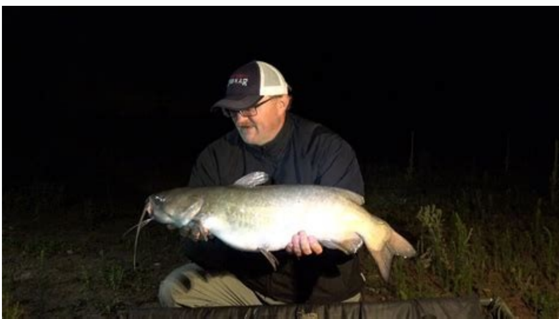
Fishing report chatfield reservoir colorado. What kind of fish are in chatfield reservoir.